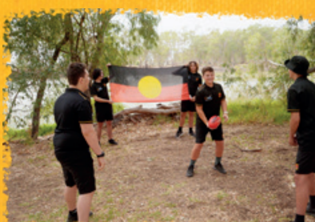
Swan Hill Clontarf Academy students on the banks of the Murray River, taken during filming of their Acknowledgment to Country and smoking ceremony